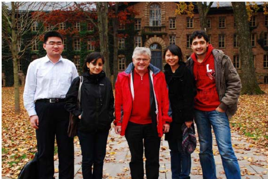
CRC 649 members at Princeton University